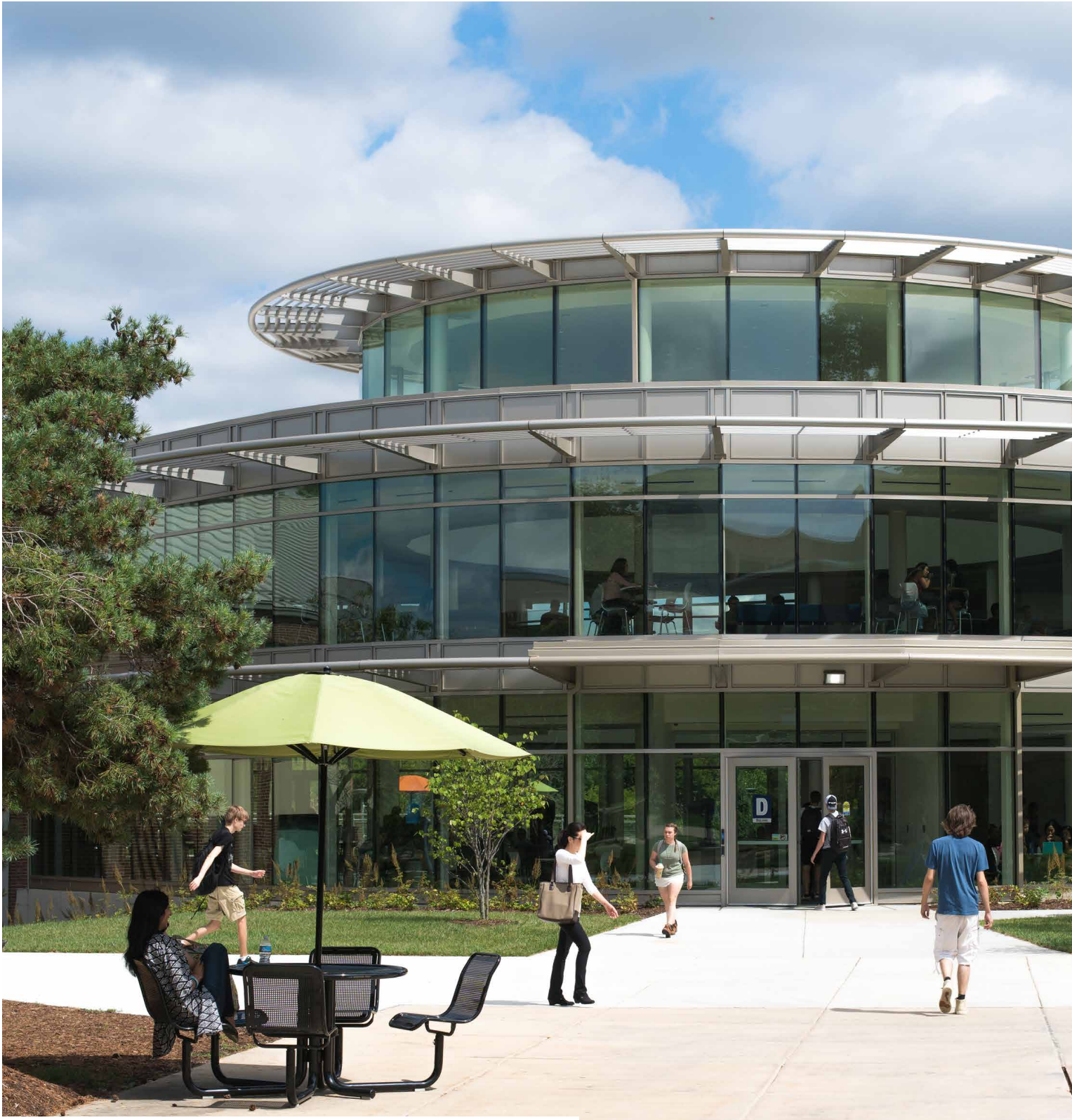
The Harper College Diverse Faculty Fellow Program opens the door to individuals of historically underrepresented groups so they may gain extensive, valuable experience as a college faculty member.