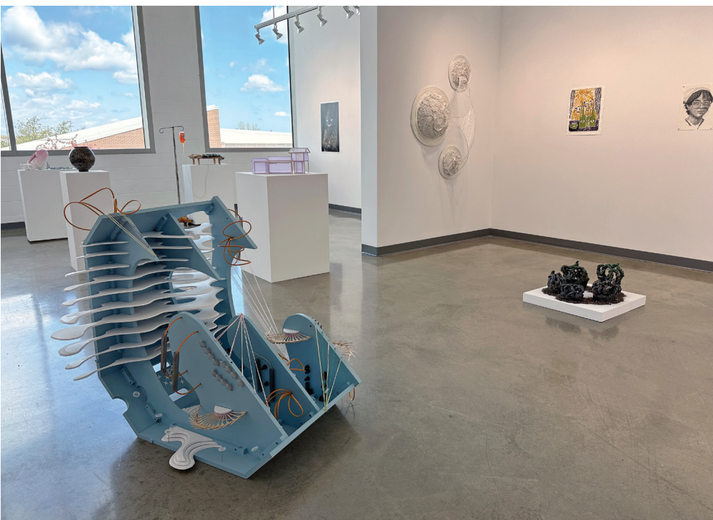
2023 Student Juried Exhibition, installation view