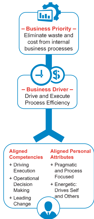
Figure 4: Aligning Success Profile components to strategy, via Business Drivers

For example, in Figure 4, you can see how the competency and personal attribute components of the Success Profile align to a specific business priority.