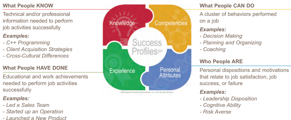
Figure 1: The Success Profile SM

DDI has created a holistic view of success (Figure 1), including—and expanding upon—competencies as traditionally defined.