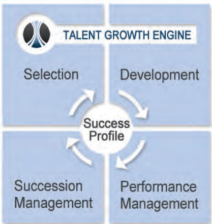
Figure 2: Fueling Your Talent Growth Engine