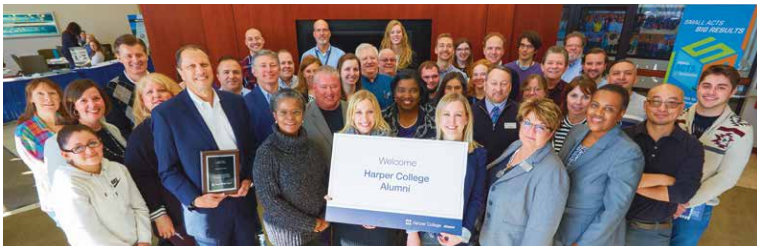
Harper alumni working at Northrop Grumman were recognized at the Harper At Work corporate recognition celebration in November 2019.

Harper College is grateful for the decades-long partnership with Northrop Grumman that benefits our community, local economy and students.