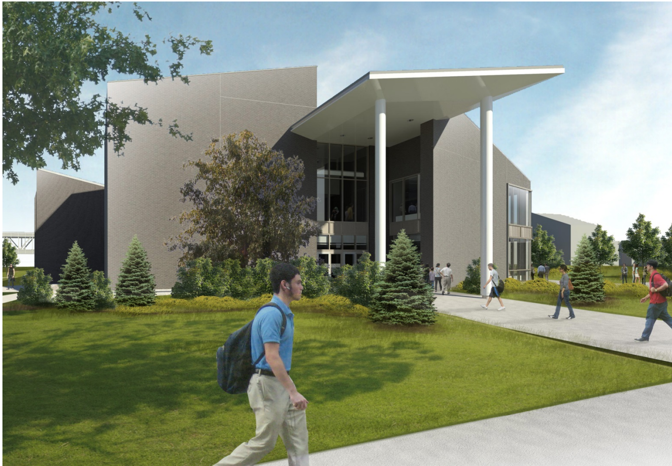
View from the west