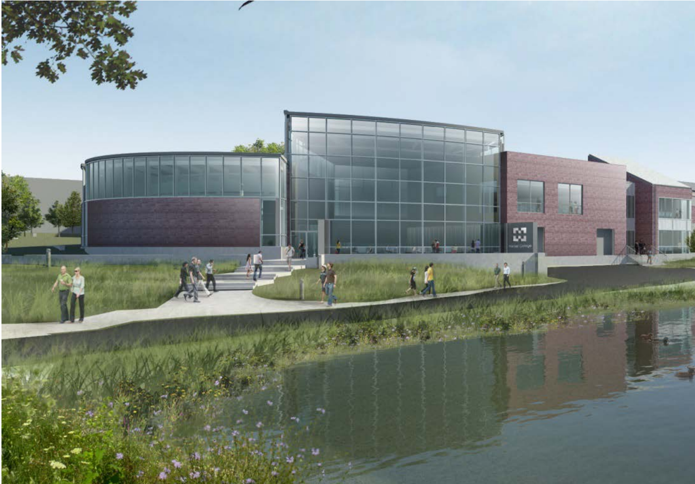
View from the north