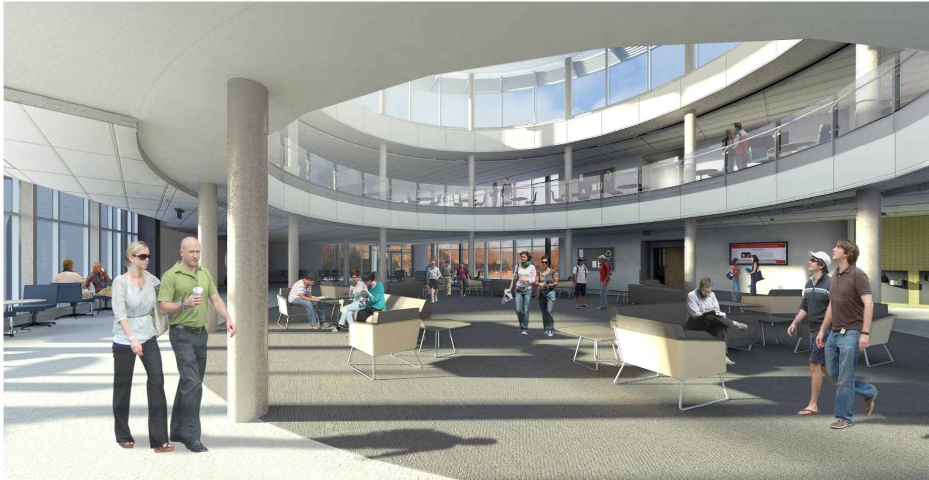
Inside the Rotunda