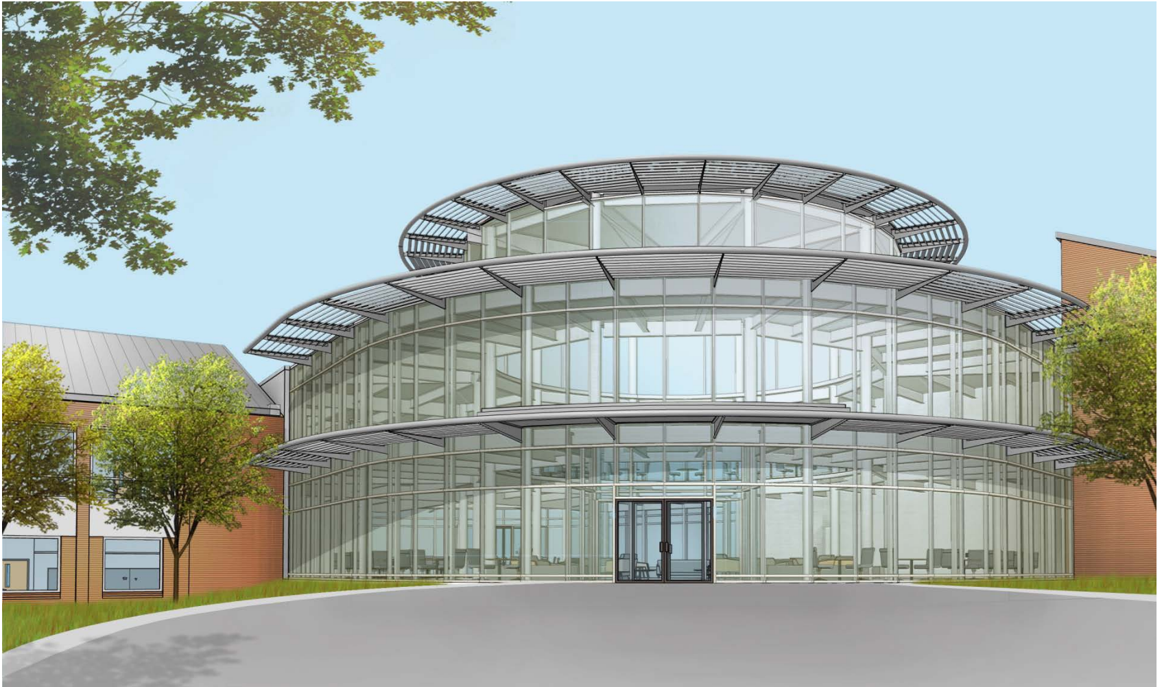
View from the south