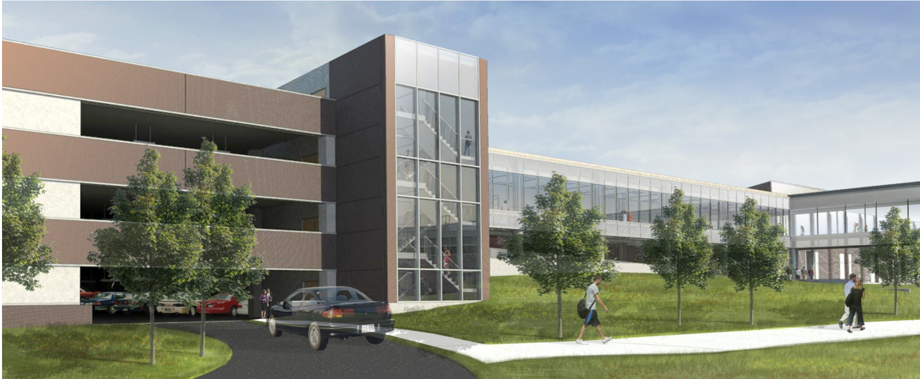
View from the north