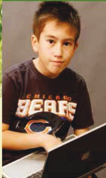
Justin: Game Generator