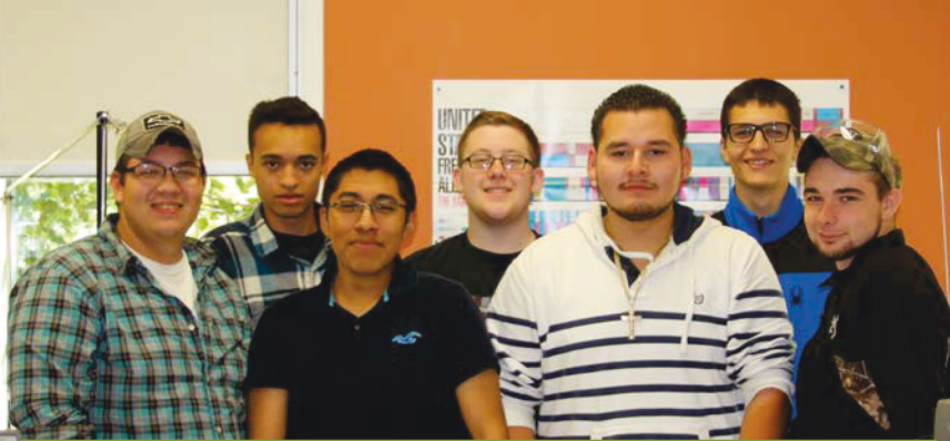
Manufacturing Cohorts 1 & 2