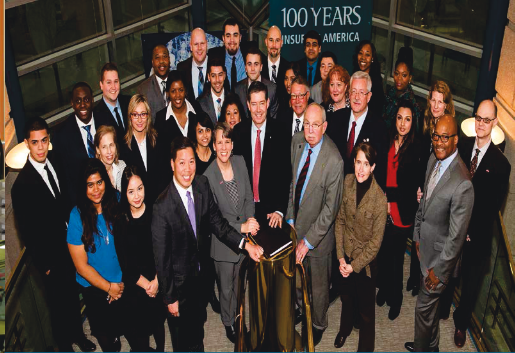
General Insurance Cohort 1