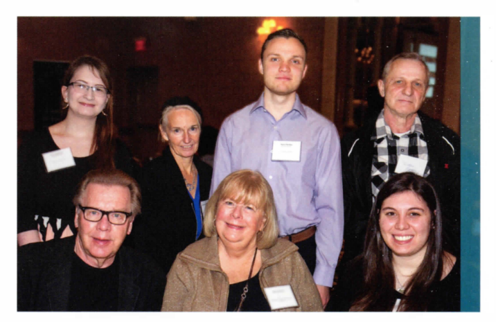
Scholarship recipients met with their scholarship donors at the Harper College Realizing Dreams Breakfast