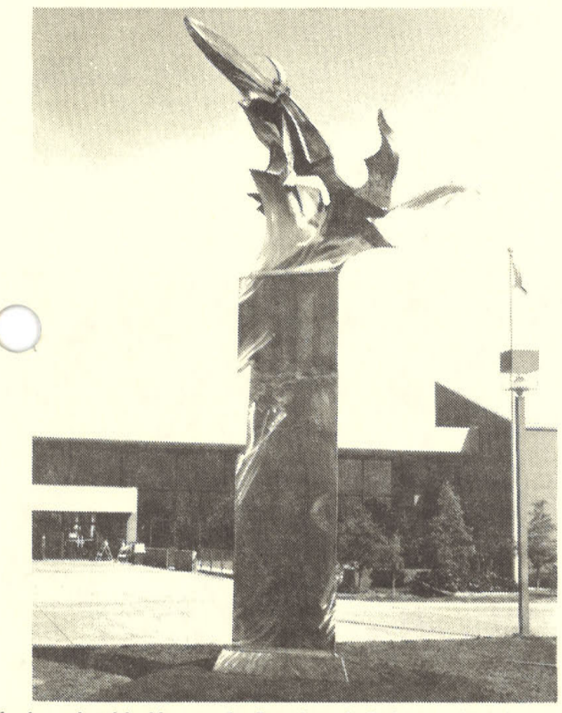
Hunt used welded bronze for Freedmen's Column, which he completed in 1988. The sculpture has been placed in front of Building A.