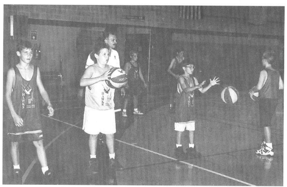
Harper's sports camps and the PEAK program marked another successful summer. Here students in the basketball camp work on fundamental ball handling skills.