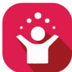
Student Life & Athletics